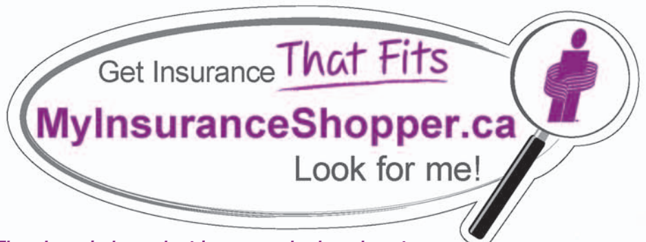
There's an independent insurance broker close to you.

Remember, focus on the task of driving, with your hands on the wheel and eyes on the road. Reduce the distractions that may cause you to overreact or respond too slowly to a situation.